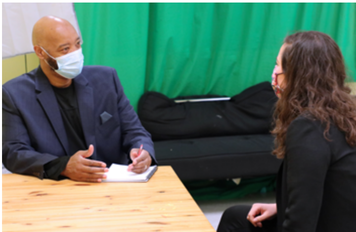
ABOVE TOP: The flowchart was part of a presentation the Youth Council created to showcase their vision for a Teen Lounge that includes a multi-media arts room.