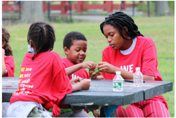
Youth Council members look out for the younger children in the afterschool program.

The students focused on operational planning and budgeting for the Teen Lounge project. The numerous life skills they were able to