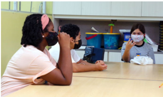
Members of the Youth Council discuss new ideas and plan future projects.