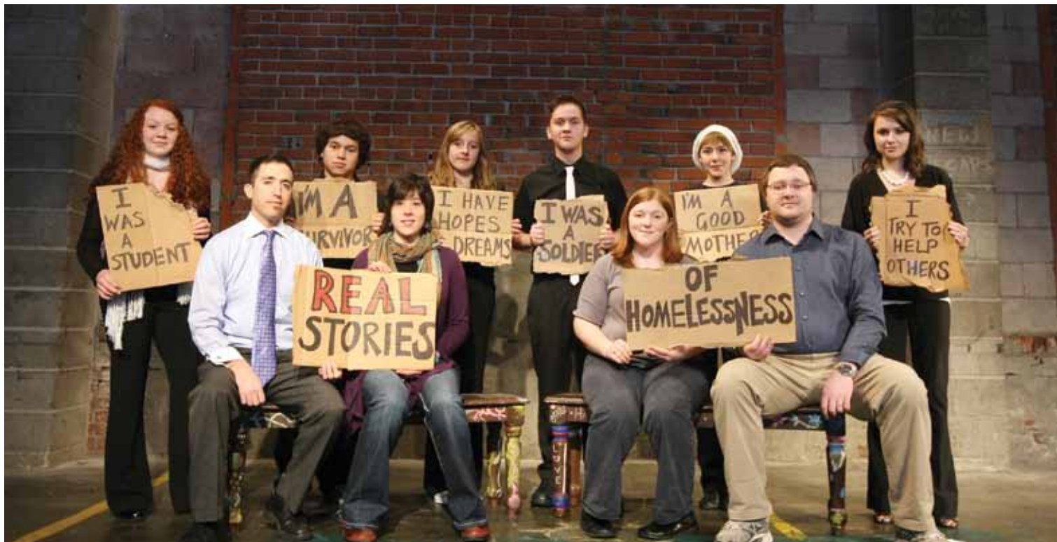
The Venture Theatre in Billings, Mont. shows the many faces of homelessness in this scene from their series of monologues, A Heart Without: Real Stories of Homelessness.