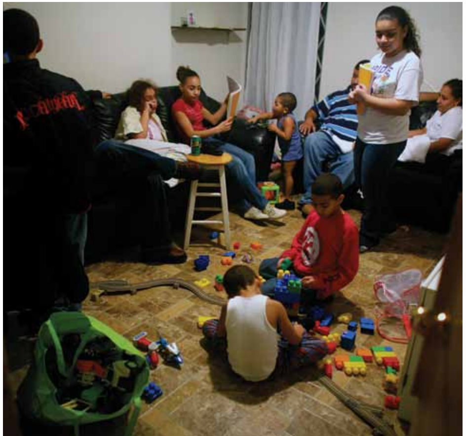
Although family homeless shelters are more prevalent in urban settings than they are in rural ones, the weak economy has resulted in more families applying for shelter. The tenant in this one-bedroom apartment in Brooklyn recently took in her unemployed daughter and the daughter’s family, resulting in 13 people sharing this small home.