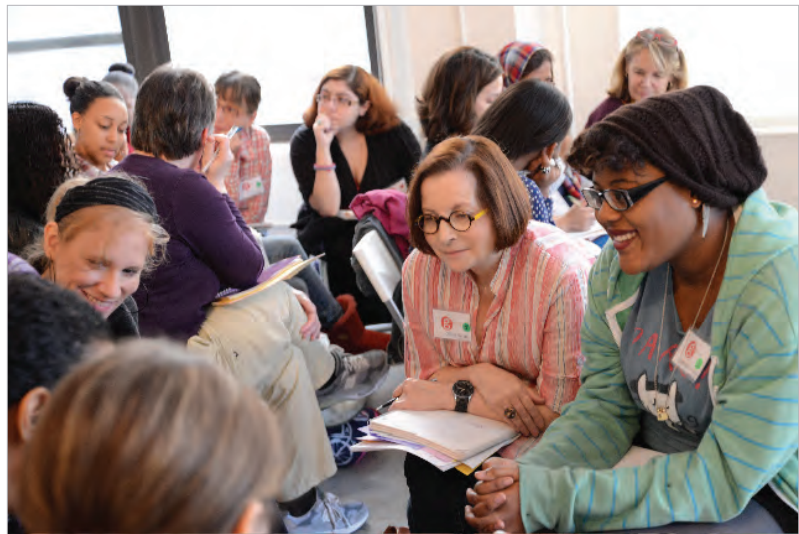
Mentors and mentees peer critique during a Girls Write Now workshop.

open up your mind and heart to new experiences. The GWN theme this year is ‘new worlds,’ which is a perfect one, I think.”